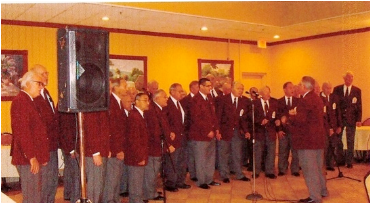
BARBERSHOP A L'ITALIA at Domenico's Restaurant in Levittown provided a new type of venue, at which the Long Island Harmonizers displayed their wares to a dining audience, supper-club style.