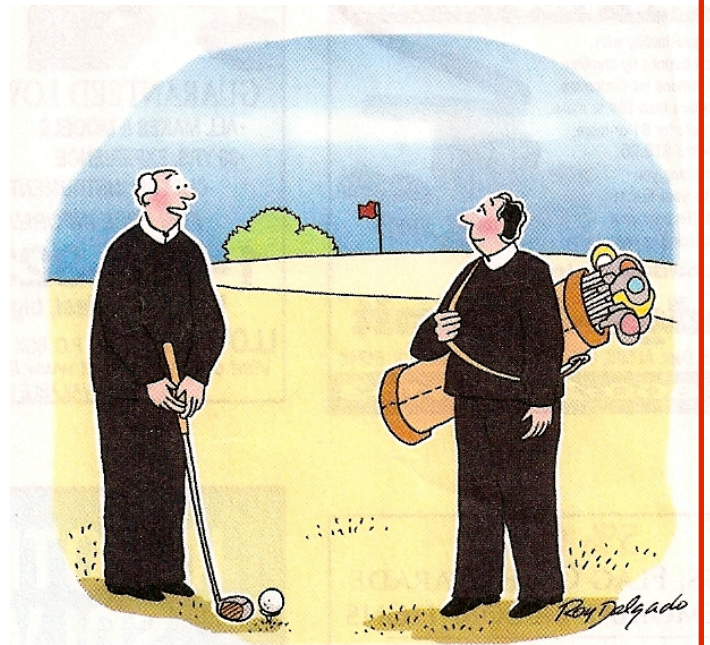
"Thank God it's Monday."