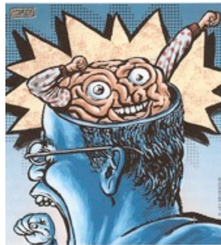
By Andrew Newburg | YAWN!

It's one of the best things you can do for your brain.